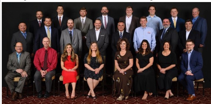
2022 NRECA Management Internship Program Graduating Class

The MIP program is provided exclusively for rural electric cooperative CEOs and top-level managers. This allows for greater emphasis of study on management and leadership challenges and the aspects of consumer-ownership that cooperatives enjoy. Participants focus on member value as part of daily decision making and leave with a better understanding of what consumers want and how to ensure they get it.