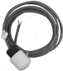
Part # 1302033

Provides outdoor temperature information to Steffes 2100, 2000 and/or 1000 series room units as well as Comfort Plus central systems for automatically regulating brick core temperature.