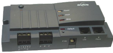
Part # 1302034

Provides room temperature set back signals to Steffes 2100, 2000 and/or 1000 series room units through telephone communication.