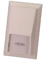
Part # 1302024 (1-heater) 1302041 (2-heater) 1302042 (3-heater)